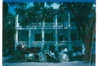
You'll feel like you've traveled back in time!