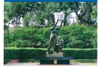
Savannah - the "Belle of Georgia"