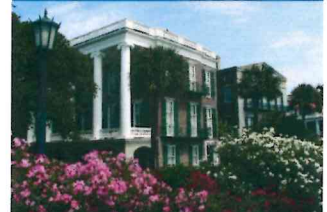
Charleston, SC - "America's Favorite City"